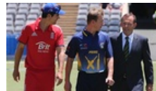
England Makes 264-8 vs. Prime Minister's XI