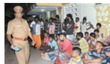
Poaching May Top Talks Agenda