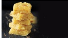
A Chronicle of South Indian Food Philosophy