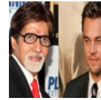
English I'd Love to Work with Amitabh Bachchan Again Says DiCaprio More