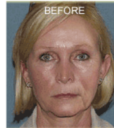
Clever Mom Uses $5 Trick to Erase Wrinkles And Looks Younger Instantly! Read More...