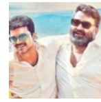
Reviews Weak, Convoluted Screenplay, Lacklustre Narration Mar Jilla More