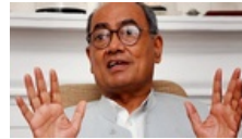
Telangana First, TRS Merger Move Next: Digvijaya