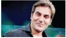
'The Body Needs a Bit of Everything'