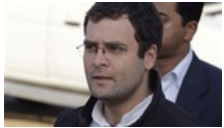
'Ready for Whatever Party Wants Me to Do'