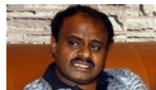
'Save Karnataka' is JD(S) Slogan for LS Elections