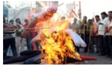
Telangana Issue Casts its Shadow on Sankranti