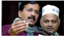
Somnath Bharti Denies Tampering, Kejrival Backs Him