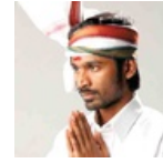
Tamil 'Anegan' Keeps Dhanush Busy on Pongal Day More