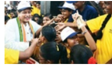
Change Society, Youth Told