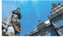
The City of Childe Rolande