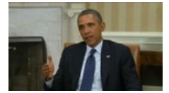
Obama Says, Has 'Faith' in Afghan Strategy