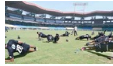
Federation Cup Returns After 37-Year Hiatus