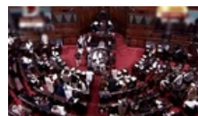
Three for Congress, 2 for TDP; All Eyes are on 6th RS Seat