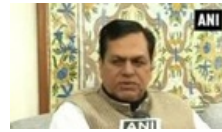
Akhilesh Yadav Blacks Out TV channels for Criticizing Him