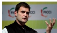
RaGa Limits His Charm Offensive to Congress Workers